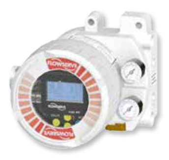
The Logix 420 allows for fast commissioning, as well as accurate and reliable control at a very competitive price.

Equipment requiring long commissioning times, unreliable control, or frequent repairs could severely impact the economic success of the enterprise. Alternatively, a product that is easy to set up, provides years of reliable service and has its own diagnostic warnings may significantly improve the financial outcome for the operation. With the Logix 420 model, you get all these features at a very competitive price.